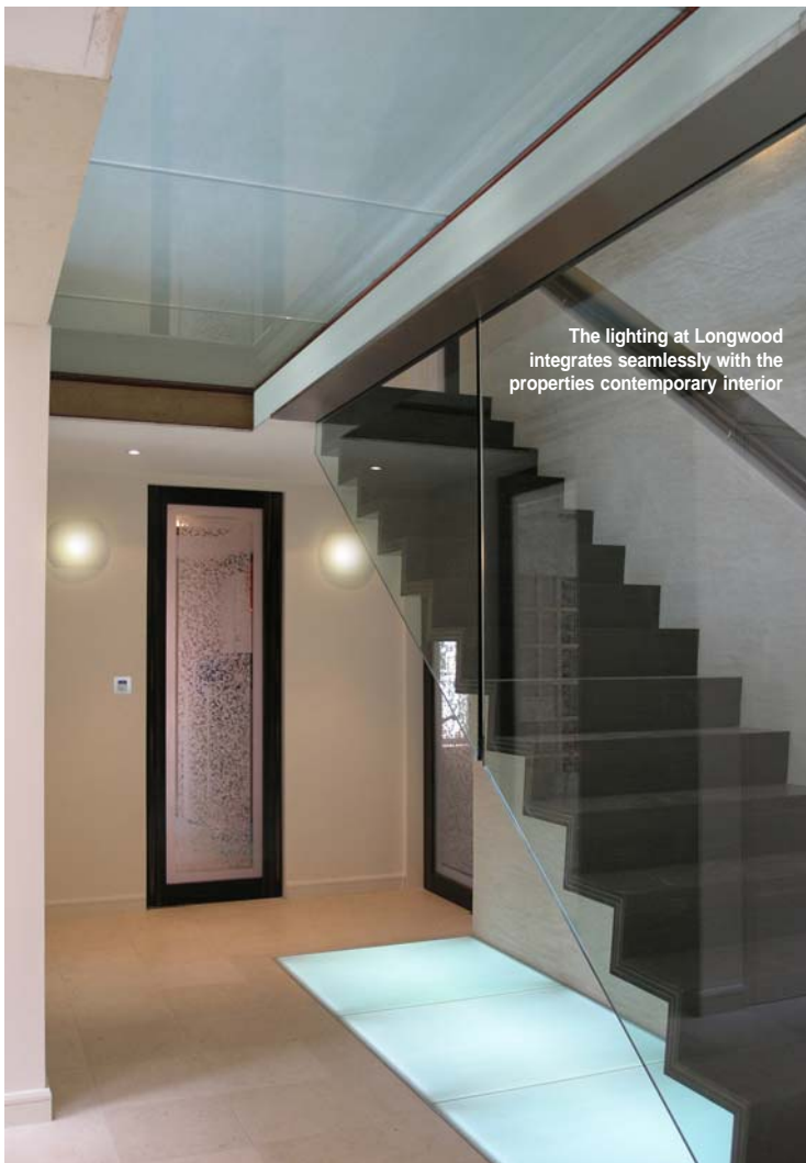
The lighting at Longwood integrates seamlessly with the properties contemporary interior

A design point that carries through to one of the reception rooms where dimmable fluorescents have been used effectively for backlighting the 42-inch plasma screen wall-mounted there.