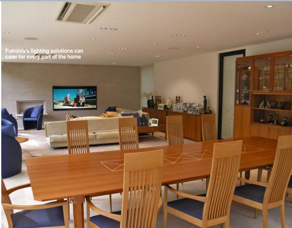
Futronix's lighting solutions can cater for every part of the home